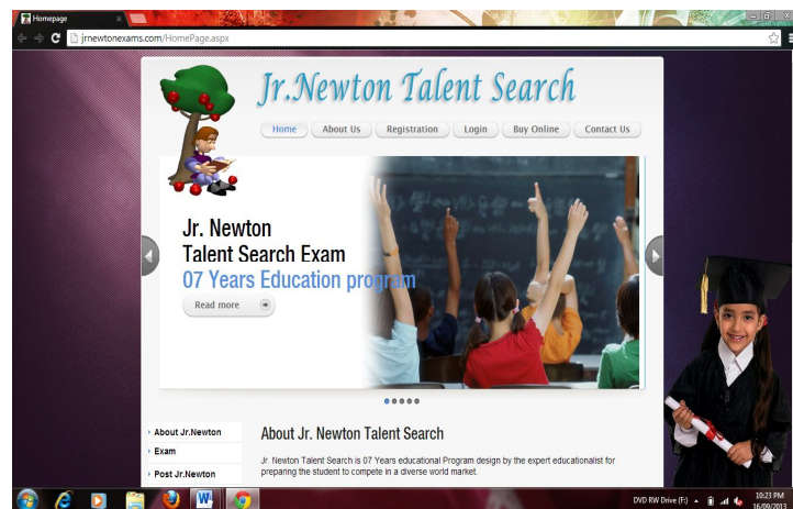
Fig 3: Home Page.

All the registered member will be provided with free update service through sms /e-mail service. Updates regarding the examinations will be provided on a real time basis through messages and e-mails to keep students and parents involved in the examination process and provide better services to the users to enhance their experience.