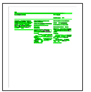
Fig5a: Original Image Fig5b: Detected Text of 5a Image