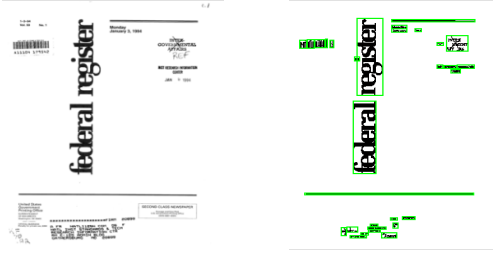
Fig2a: Original Image