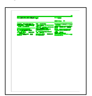
Fig4b: Detected Text of 4a Image