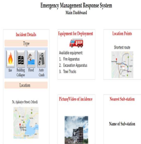
Figure 2: Back-end Server System Dashboard

All information about the best travel route for first responders and likely equipment to deploy to incident site, are displayed through a dashboard at the server application backend. Figure 2 shows this dashboard.