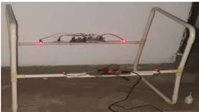
Figure 1: Temperature reading during day time

This experiment was repeated by varying the temperature in range from 5 °C to 50 °C which is generally the annual weather temperature in the area of observation (Ara, Bihta and Patna of Bihar). The above experiment can be shown through Figure1 and Figure 2 respectively.