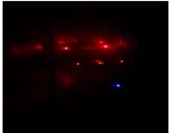
Figure 2: Temperature reading during night time

In the above figure Figure 1, temperature reading during day time is being shown. In figure Figure 2 temperature reading at night is shown[14].